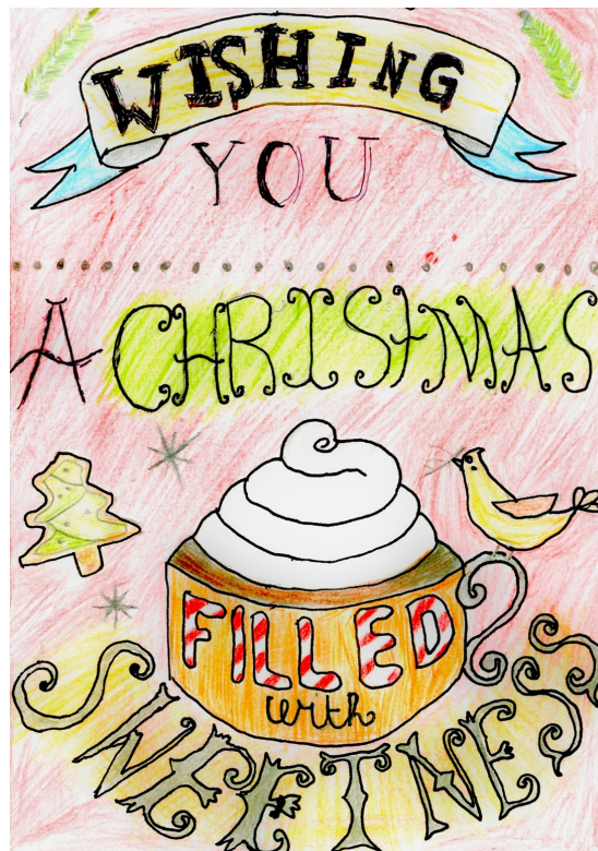
BY ROHAIL KHAN (YEAR 8)